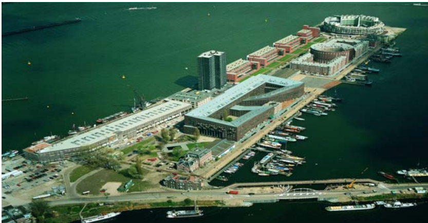
Amsterdam Eastern Docklands

NADC and Regional Plan Association (RPA) established the New Amsterdam Waterfront Exchange in 2002 to encourage and support both cities in creating these visions and models. Public officials, developers and other redevelopment experts from New York and Amsterdam participated in workshops to understand possibilities for future redevelopment.